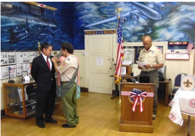
Dad gets pin too.