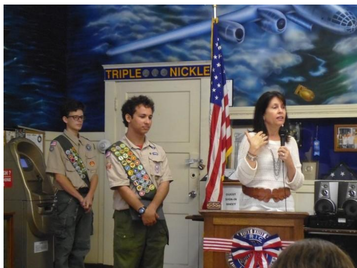
Words of honor from his project beneficiary.