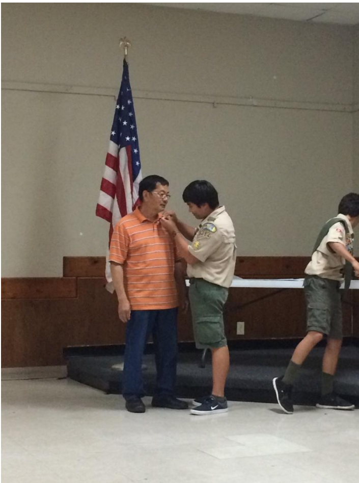
Proud Dad gets his life pin.