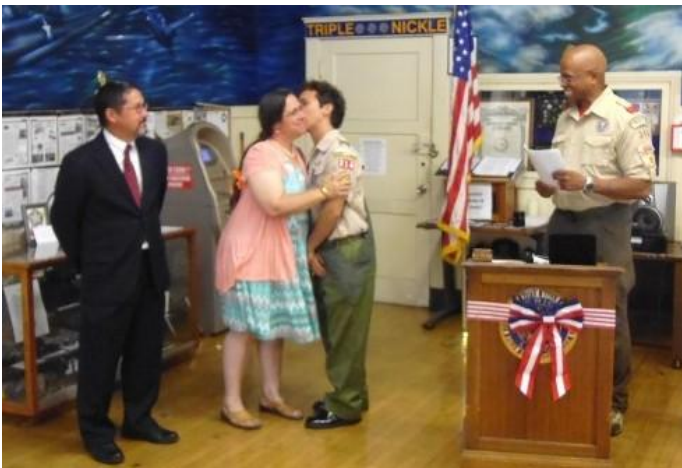
And a Kiss.