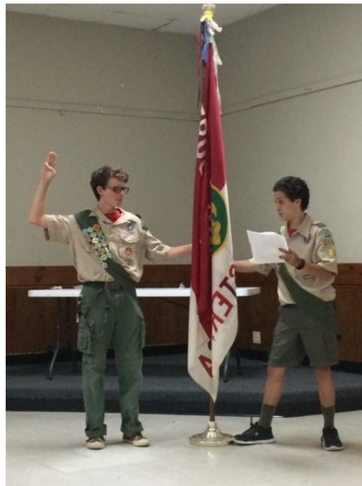
New Officers sworn in.