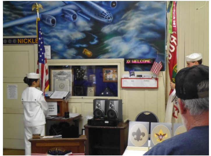
Retrieving the colors.