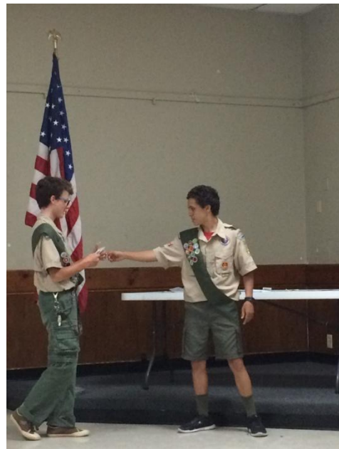
Service pins awarded.