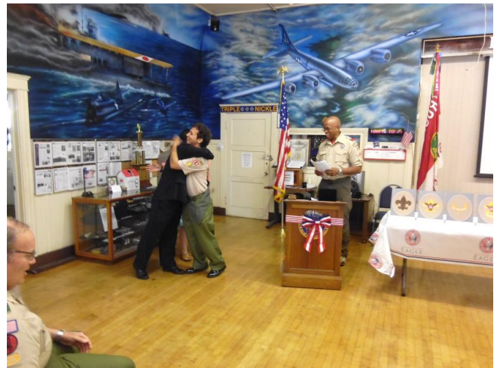
... and a Dad hug for New Eagle.