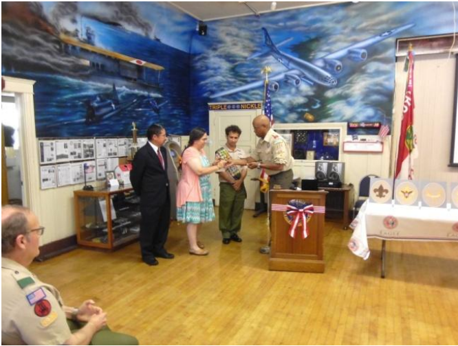
Mom gets a Eagle pin.